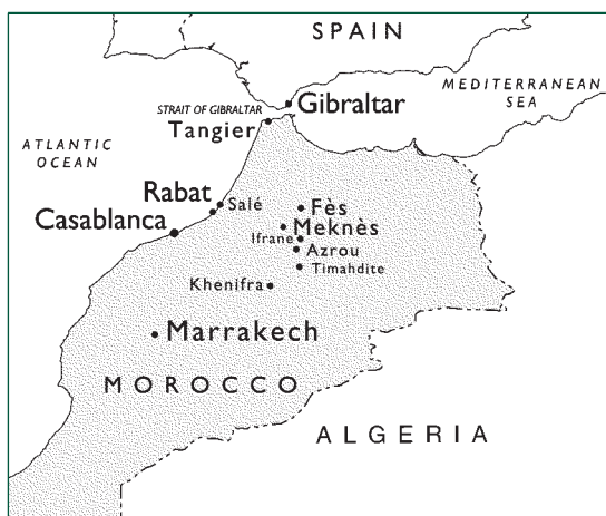
Fig. 1. Map of Morocco showing some of the survey sites.

Barbary Macaque Macaca sylvanus , mother and young. Atlas Mountains, Morocco.