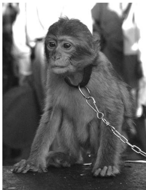
BARBARY MACAQUE OPENLY ON SALE IN MARRAKECH (PLACE JMA FNAA).

Loss of significant numbers of individuals can have wider repercussions throughout the ecosystem. For example, primates often perform a primary role in seed dispersal. Loss of such species will reduce seed dispersal, which, in the long term, will affect forest composition.