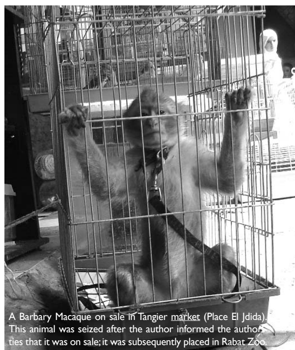
A Barbary Macaque on sale in Tangier market (Place El Jdida). This animal was seized after the author informed the authorities that it was on sale; it was subsequently placed in Rabat Zoo.

Table 1 shows an overview of the level of trade at the survey sites. Not many macaques are openly offered for sale, with the exception of Marrakech (an average of six