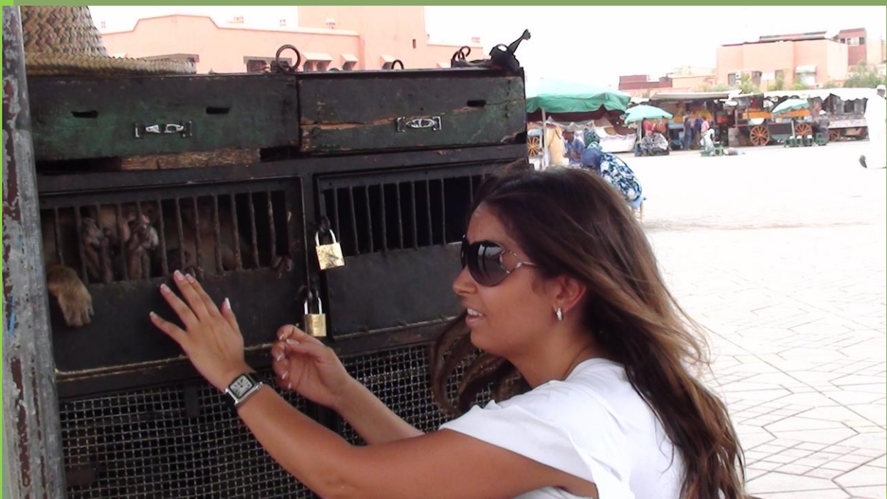
Nabila was very upset to see these young macaques for sale