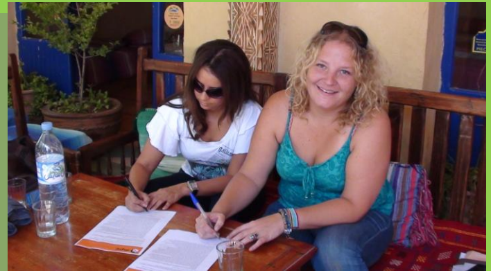
Signing the contract....