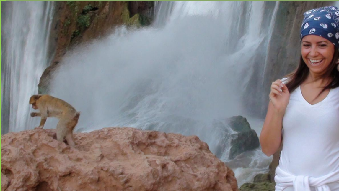
Nabila in Cascades d'Ouzoud with the wild Barbary macaques